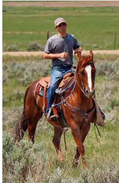
LEARNING THE ROPES - Branding day at the Barthelme ranch is a big event for friends and family and a chance for the next generation to learn the business