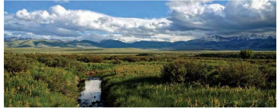
Cabin Creek in the Big Sheep area of the High Divide