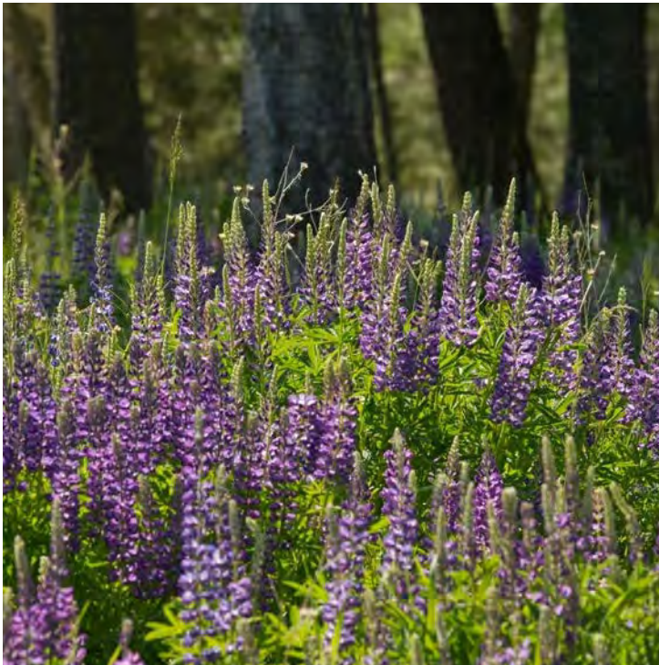
Lupine in their glory

Legacy land also added 14,624 acres to the Swan River State Forest. The acres were sold to the Montana Department of Natural Resources and Conservation, with a conservation easement in place with the state's Department of Fish, Wildlife & Parks. The easement will permanently limit permanent development of the land while allowing it to remain a working forest.