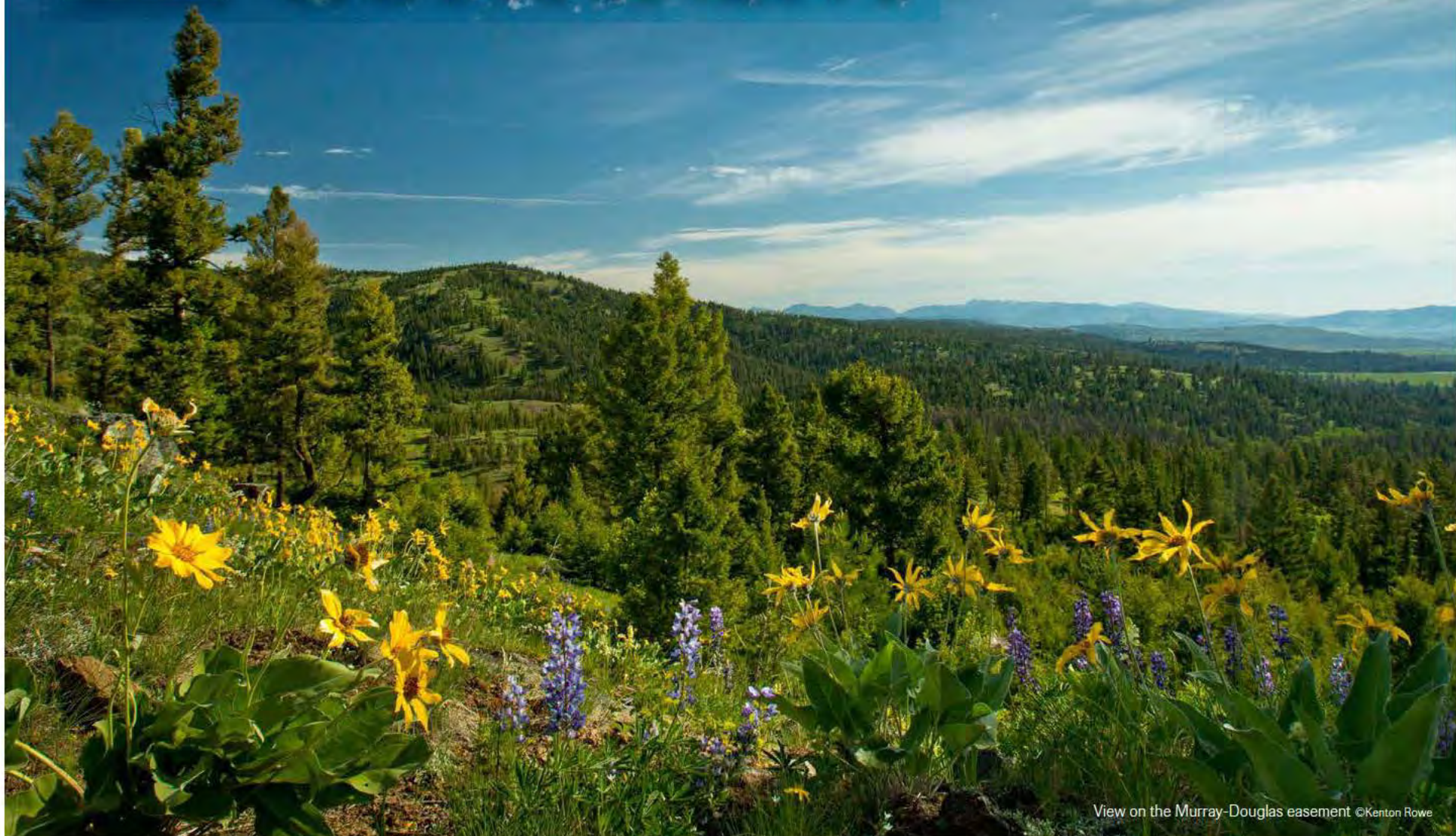
View on the Murray-Douglas easement