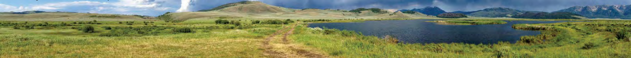
Wigeon Pond, Centennial Valley