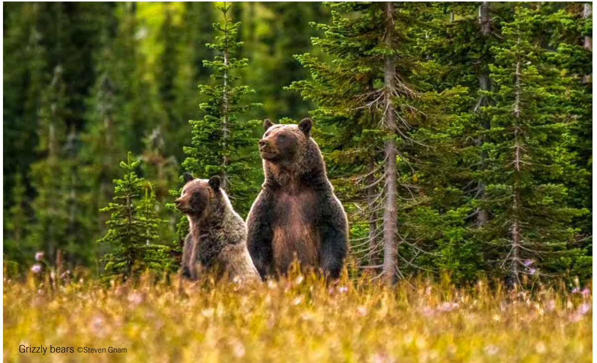
Grizzly bears