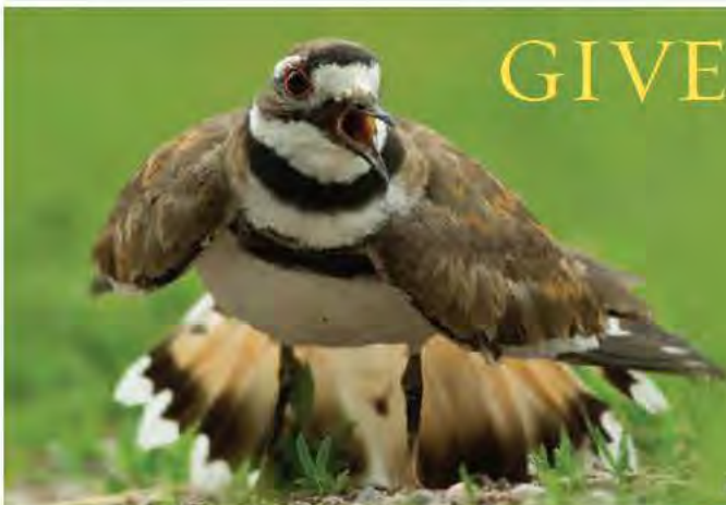
Killdeer protecting the nest

We've included an envelope with our address.