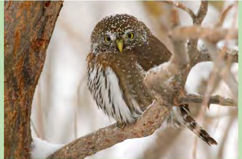
Northern Pygmy Owl