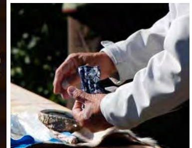
Preparing to burn an offering during the honoring ceremony