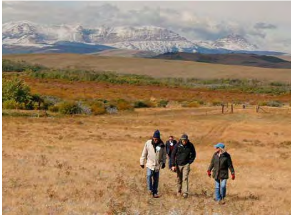
Montana trustees, staff, and Blackfeet partners hike on the sanctuary

Under a brilliant blue sky, in the face of the notoriously buffeting winds of the Rocky Mountain Front, the Yellow Bird Woman Sanctuary was dedicated, this September, in honor of the late Eloise Cobell. Cobell, whose Blackfeet name is Yellow Bird Woman, became a heroine for native people by waging a 15-year legal battle over the federal government's management of billions of dollars in Indian trust funds. The funds came from payments for mining and