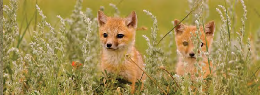
Land under easement on the Carroll ranch near Bitter Creek