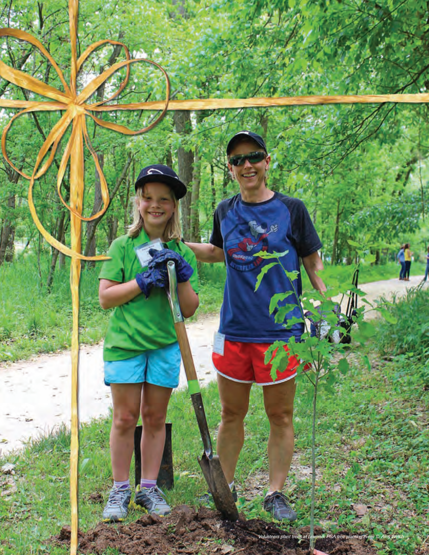
Volunteers plant trees at Lexmark PGA tree planting event