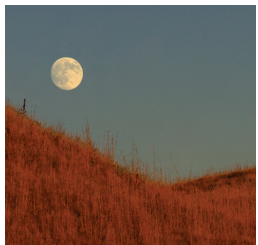
Evening moonrise in the Loess Hills of western lowa.