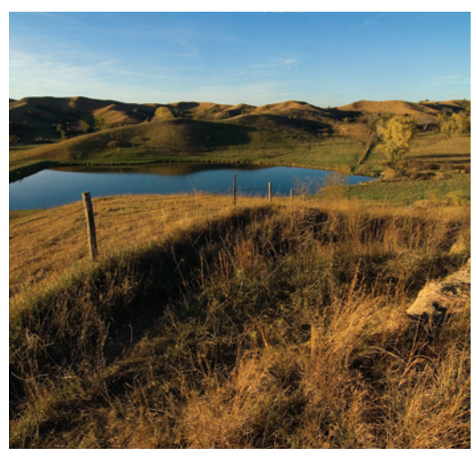
Broken Kettle Grasslands Preserve in the Loess Hills