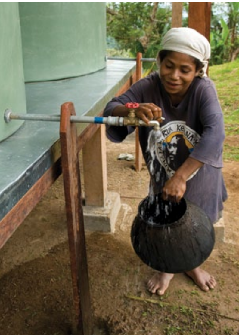
A villager gets freshwater for cooking from a rainwater collection unit in the small village of Turutapa in the Adelbert Mountain Range of Papua New Guinea's Madang Province. Turutapa, which can only be reached on foot, installed the storage tanks with the help of The Nature Conservancy, relieving the villagers of the need to walk long distances to collect freshwater.