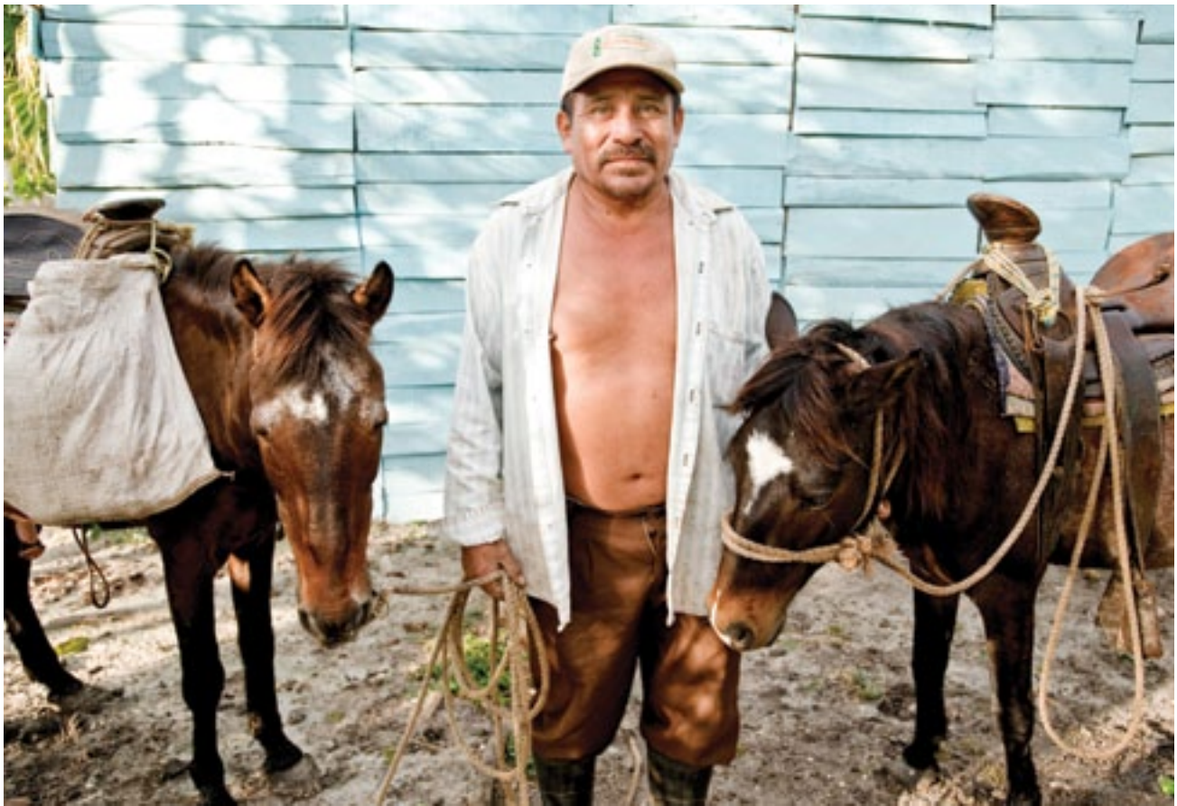
A chiclero stands with his ponies outside his home in the ejido Veinte de Noviembre, situated in the Maya Forest of Mexico's Yucatan Peninsula.