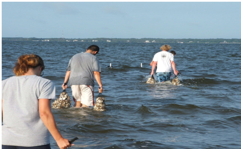
Volunteers building oyster reef, which will reduce shoreline erosion

Oyster reefs are being constructed along shorelines exposed to high energy wave action to provide a natural buffer for the projected increase in frequency and severity of nor'easters and hurricanes associated with a changing climate. The reefs diminish wave energy, reduce erosion and create semi-sheltered shorelines. Reefs also provide other valuable ecosystem services – filtering water and creating habitat. These fringing reefs may be located in areas that, although less than ideal today, should become more amenable to oyster survival under future climate conditions. Along lower energy shorelines, we are developing techniques to restore beds of submerged aquatic vegetation to reduce shoreline erosion.