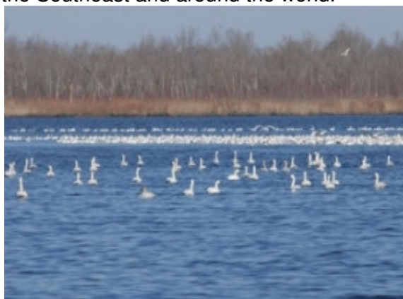
Pocasin Lakes National Wildlife Refuge