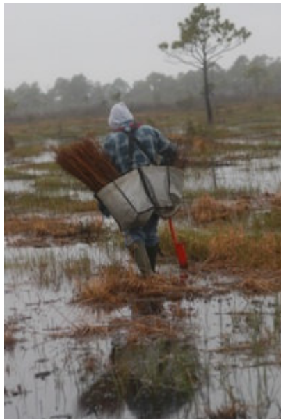
Planting trees at the Refuge

To ensure ecosystem stability and to reduce the likelihood of catastrophic change, we are planting salt- and flood-tolerant vegetation on altered lands. Shore zones likely to be submerged in the short term are being restored immediately using brackish marsh vegetation. Flood-tolerant black gum and bald cypress are being planted wherever the land has been cleared to ensure soil stability as the shoreline transitions inland.