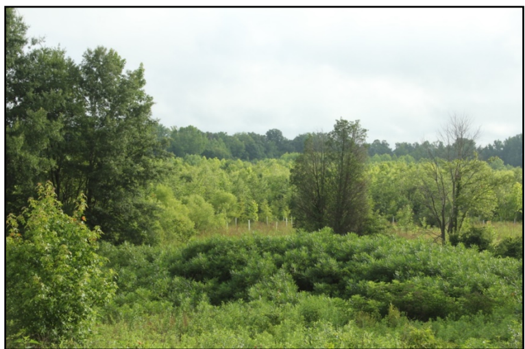
A comparison of the same view from the southern hillside looking north across restoration area, before construction in 2006 (left) and after 9 years of growth in 2015 (right).