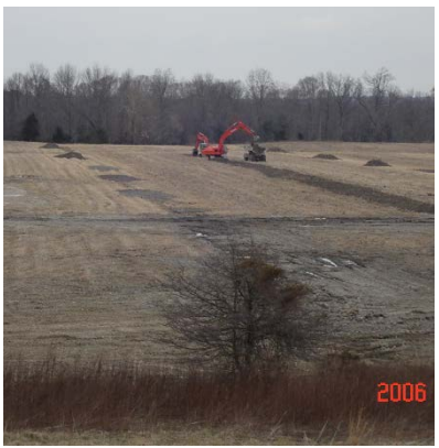
Filling field ditches in 2006.

construction of field ditches. These ditches caused increased levels of erosion contributing to pollution of the Chesapeake Bay. The Nature Conservancy purchased a conservation easement on this privately-owned property in 2004 and began restoration efforts in 2006.