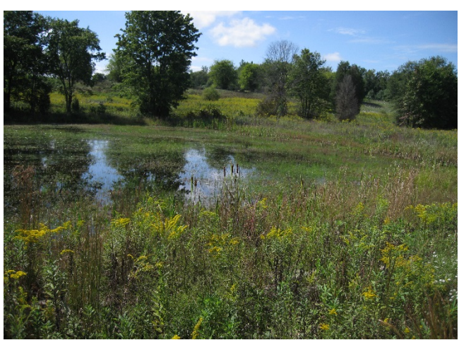
Meadow Farms 3 years after restoration efforts. 2009.

depend on this natural landscape. Meadow Farms was an abandoned agricultural field whose wetlands had been drained through the