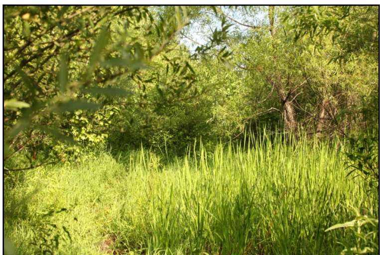
A comparison of the same view from within the eastern wetland cell looking south, before construction in 2006 (left) and after 9 years of growth in 2015 (right).