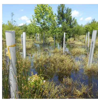
Trees were planted in 2007

<u>Status and Outlook</u>: This project has improved wildlife habitat, water quality, and has increased flood storage. These newly restored lands can once more contribute to the natural beauty and functioning of Virginia's Middle Peninsula and will be protected by the conservation easement in perpetuity.