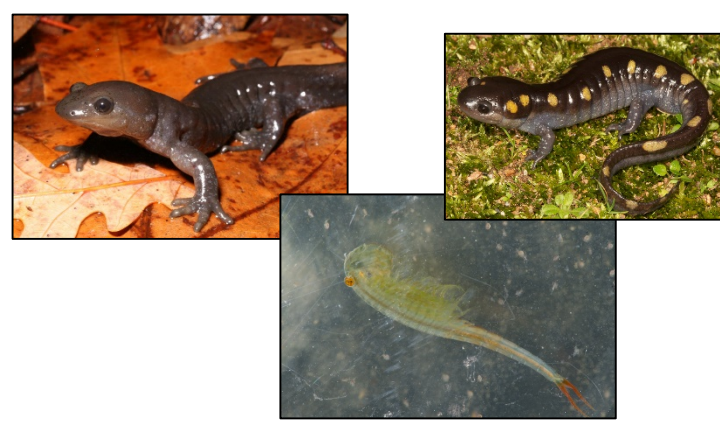
Jefferson salamanders, spotted salamanders, and fairy shrimp, all of which are obligate vernal pool species, have been found onsite.