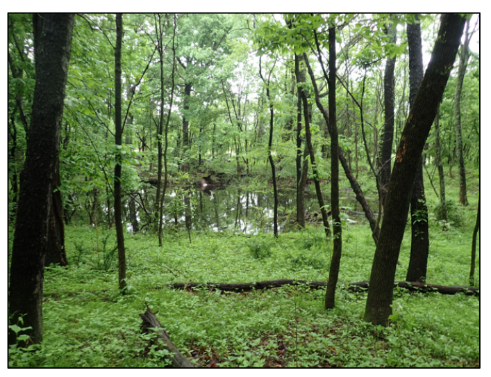
One of the existing forested vernal pools at Black Oak Wildlife Sanctuary.

To preserve and enhance the existing vernal pools and forest habitat, and to create 4+ acres of a connected matrix of wetlands that contribute to Limestone Branch and the Potomac River. This project will improve water quality, protect sensitive amphibian species, and serve as a wildlife corridor with surrounding conservation lands.