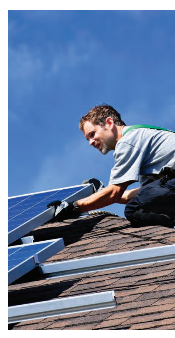
Left © iStock/jhorrocks, right © iStock/Elenathewise

The current approach also creates challenges for towns and counties that rely heavily on property tax revenues to support local schools and services. These revenues are already constrained by New York State law, which limits the annual increase in property tax to the lesser of 2% or the rate of inflation.<sup>23</sup> Full tax exemption of renewable projects, particularly large-scale projects, could make projects significantly less attractive to cash-strapped municipalities, even if the project does not impose direct expenses on the community.