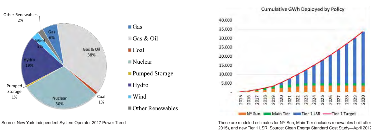
Figure 1. New York's Electricity Mix: 2016

For these reasons, the Roundtable convenors and participants committed to finding viable solutions to accelerating the pace of building new renewable energy projects to meet the Renewable Energy Standard, while preserving environmental and community values.