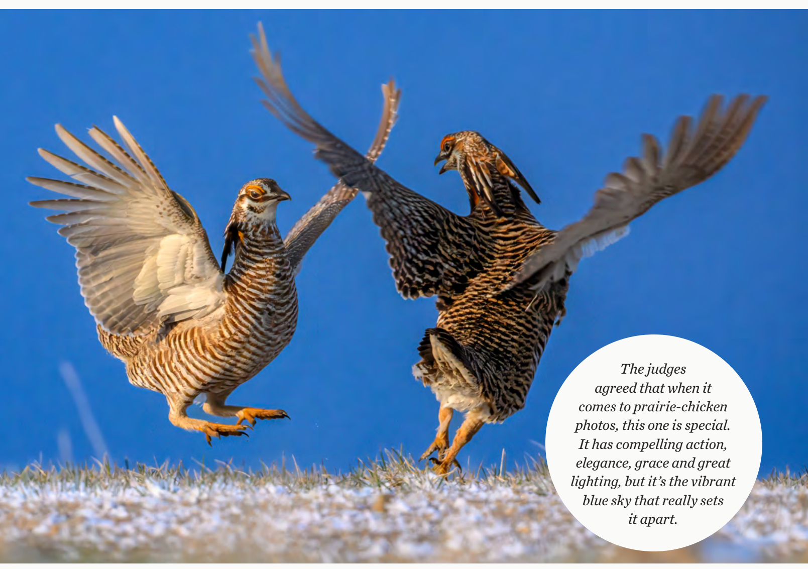
DANCING PRAIRIE CHICKENS Two male greater prairie-chickens dancing in Smith County, Kansas in late March after a dusting of snow.