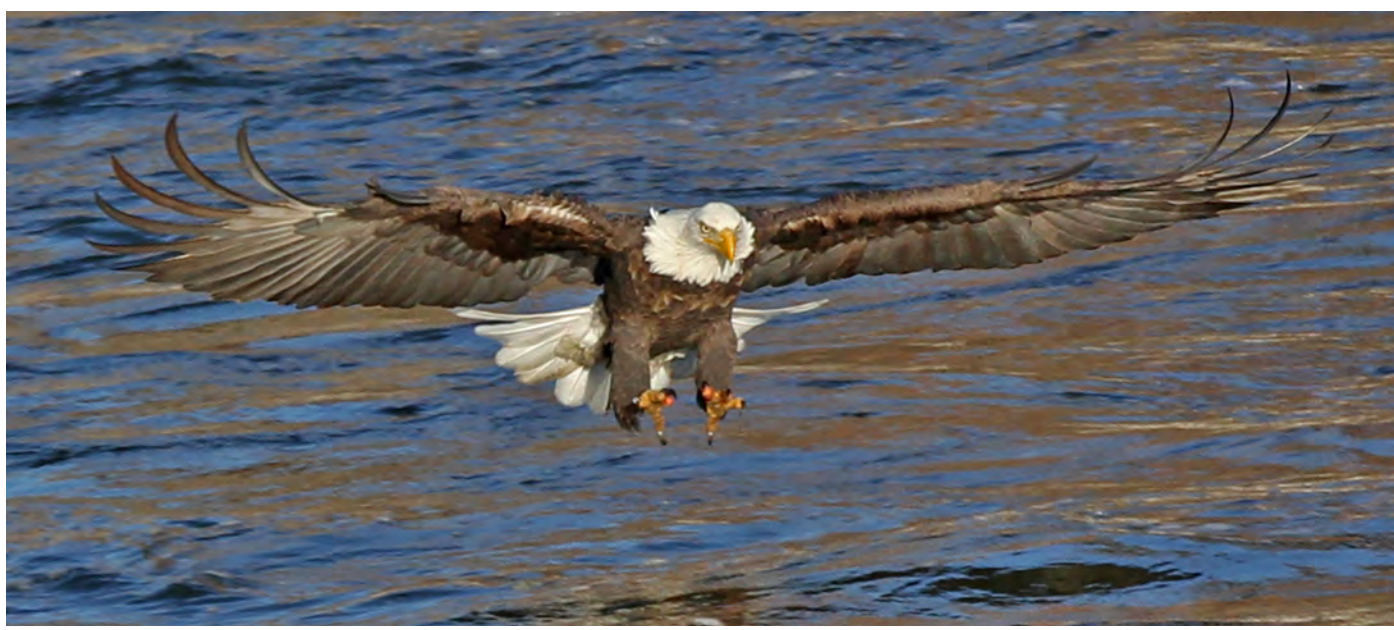
Bald eagle at Milford Lake