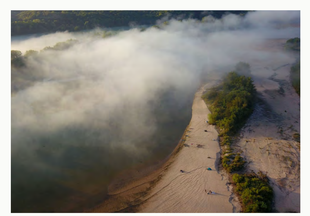
FALL CAMPING ON THE KAW This is a drone shot of a Friends of the Kaw kayak/camp trip on a huge sandbar we call the Oasis, downstream from DeSoto, Kansas. The September morning fog over the river was incredible.

This photo also received an Honorable Mention in the global contest's lands category.