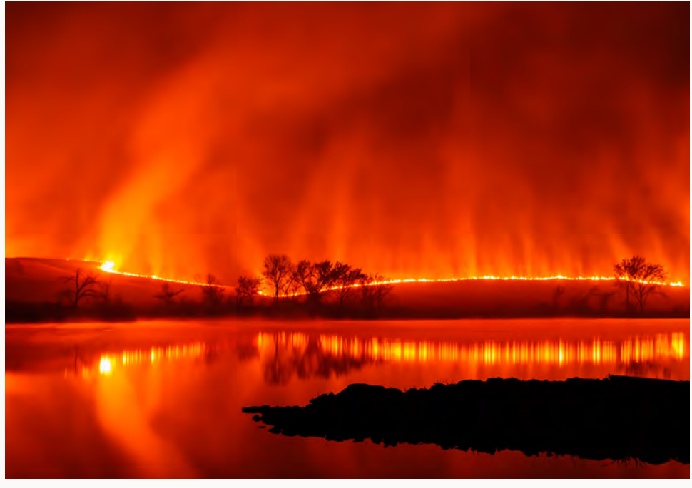
PLANNED BURN AT CHASE STATE FISHING LAKE This is the late evening on April 17, 2014 with the planned pasture burn creeping along the ridge of the hill at the end of the lake. The evening was cool and got downright chilly by 1:30 AM when we finally quit photographing. Driving back from a ranch outside Elmdale, KS, I spotted the red glow, which looked like there might be a chance it would be reflecting in the lake, and it was!