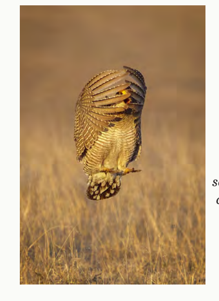
This photo received second place in the global contest's birds category.