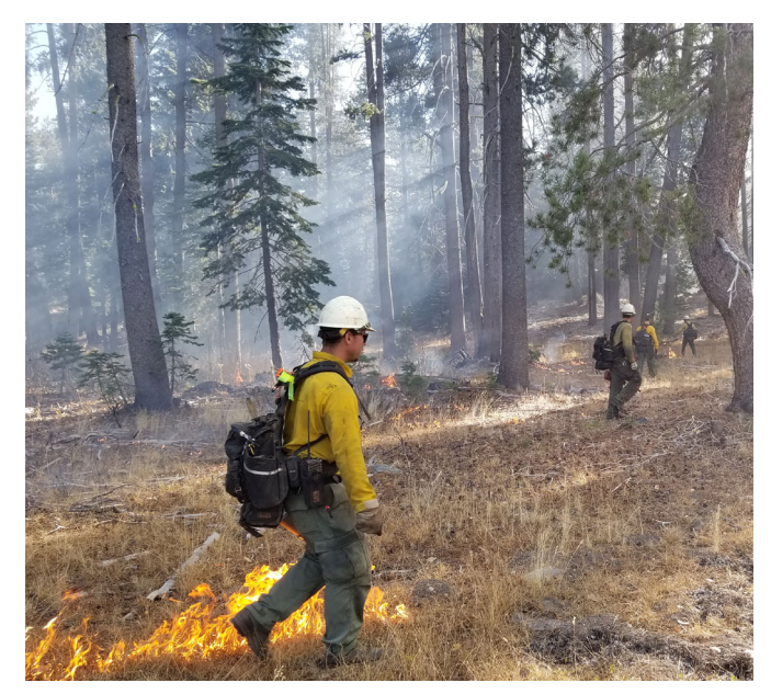
Fire crews conducting controlled burns at the Independence Lake Preserve which provides water for Reno and western Nevada.

Ecological forestry includes practices such as strategic thinning, controlled or prescribed burning, and managed wildfire. Ecological forestry practices mimic the way that