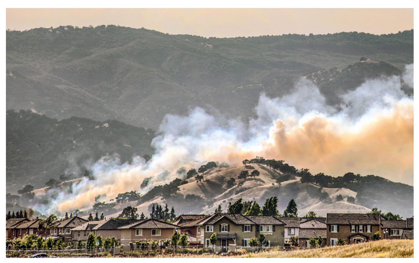
There are an estimated 4 million homes in California in the Wildland Urban Interface with moderate or high risk of wildfire.

We found that for the large "Watershed" residential portfolio, aggregate premiums could be expected to reduce, on average, by 41% (over $21 million a year). For the smaller but more exposed Foresthill community, the aggregate premium saving was estimated at 52%.