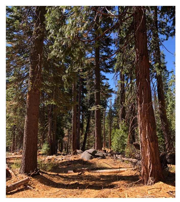
Ecologically thinned forest.

We examine an innovative solution for wildfire risk, called parametric wildfire resilience insurance, and demonstrate how it can account for the risk reduction benefit of ecological forestry. Unlike traditional indemnity insurance, parametric insurance pays out when a previously defined "parameter" is met or exceeded. For example, parametric insurance for wildfire risk could pay out when a certain threshold of "acres burned" or "acres severely burned" is exceeded, as opposed to the insured having to prove that it suffered damage and loss to insured assets from a wildfire as is the case with a traditional indemnity insurance product.