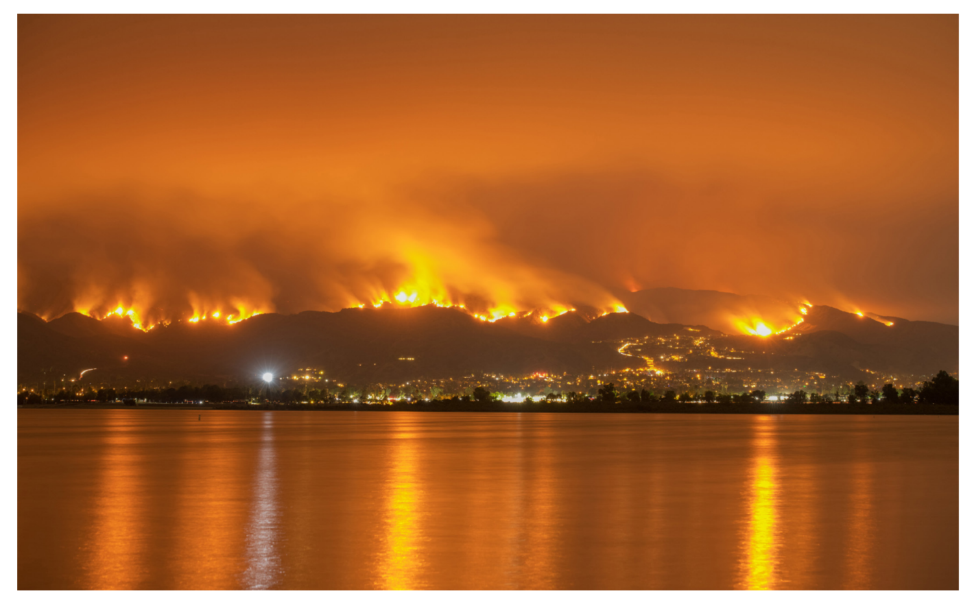
In 2018 California wildfires took 103 lives, destroyed 24,000 structures, and cost $26 Billion in property damage and fire suppression costs.

In the case of insurance availability and pricing, for a given exposure (e.g., an office building or home in a location within the Wildland-Urban Interface, (WUI), the hazard is growing due both to climate change and overgrown forests, while the ability to increase the wildfire resilience of the building (i.e., reduce the level of damage endured for a given intensity of wildfire impact) is limited. The WUI is