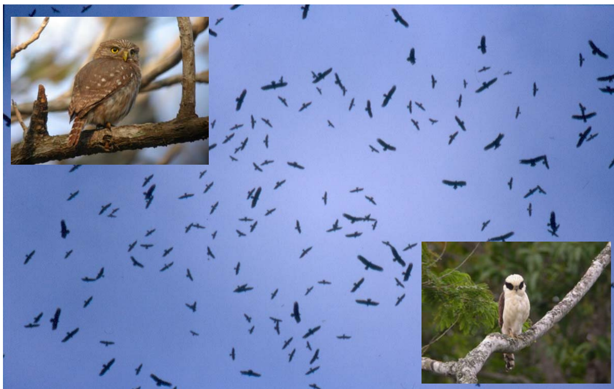
The Veracruz River of Raptors © Pronatura Veracruz; Ferruginous Pygmy Owl © Pronatura Veracruz; Laughing Falcon © Pronatura Veracruz